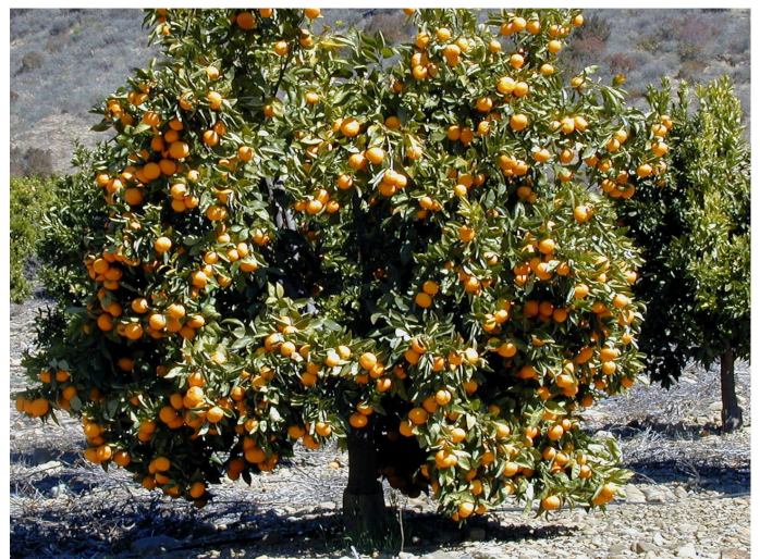
Twelve year old Gold Nugget tree (tree height 2m) showing heavy crop of medium to large sized fruit.